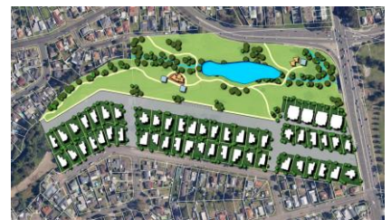
Concept & Master Plan