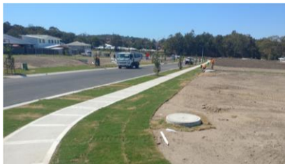
Fairfax Road Subdivision