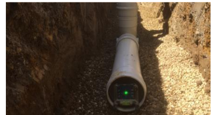
Buttaba Avenue Belmont North

For more information on our range of services get in touch with our team today.